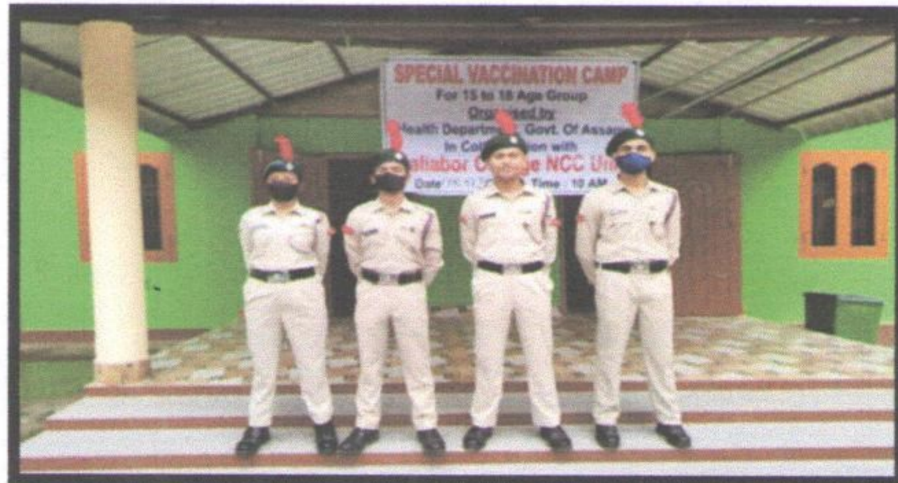
NCC CADETS INFRONT OF THE VACCINATION CAMP

Activity: Under the initiatives of Health Department, Govt. of Assam in collaboration with Kaliabor College NCC a special vaccination Camp was organised at Kaliabor College. The target group of this camp was starting from 15 to 18 Age Group. The students which were left out in the earlier vaccination camp were the main target of this programme. The Cadets successfully motivates the concerned age group. The participation of NCC cadet brings a selfless service in offering their all-around support as part of their social responsibility. During the camp 31 numbers of cadets have extended their voluntary services.