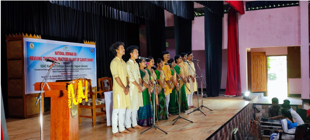
Students of Kaliabor College performing the college song during the inaugural ceremony