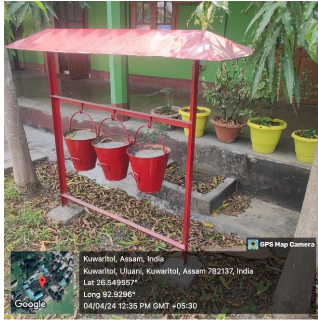
BUCKET FILLED WITH SAND AS EMERGENCY PREPARTDNESS FROM FIRE.