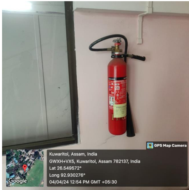
FIRE EXTINGUISHER AT ADMINISTRATIVE BUILDING