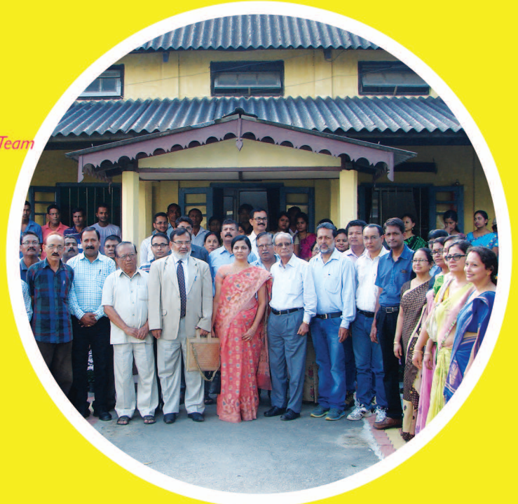
College Family with NAAC Peer Team

College encourages students' research activities. It established students innovation club and also offers "Atmaram Sarmah Satra Gobesana Bota" annually.