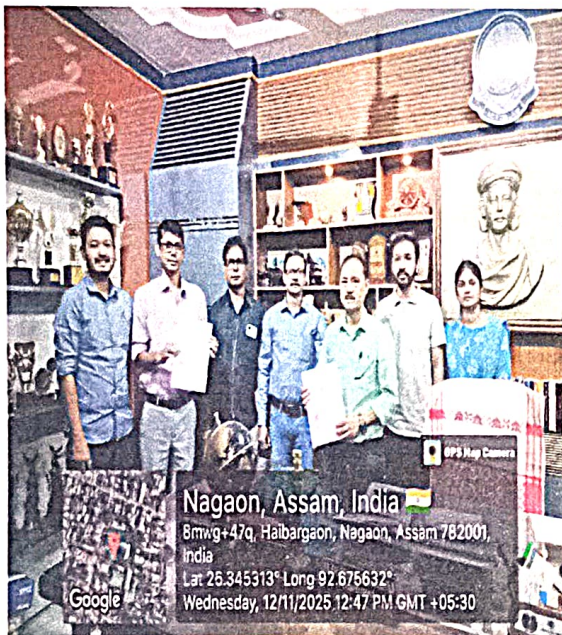
Nagaon, Assam, India 8mvg+47q, Haibargaon, Nagaon, Assam 782001, India Lat 26.345313° Long 92.676632° Wednesday, 12/11/2025 12:47 PM GMT +05:30