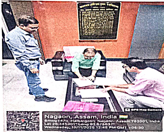
Nagaon, Assam, India 8mvg+47q, Haibargaon, Nagaon, Assam 782001, India Lat 26.345301° Long 92.676637° Wednesday, 12/11/2025 12:45 PM GMT +05:30