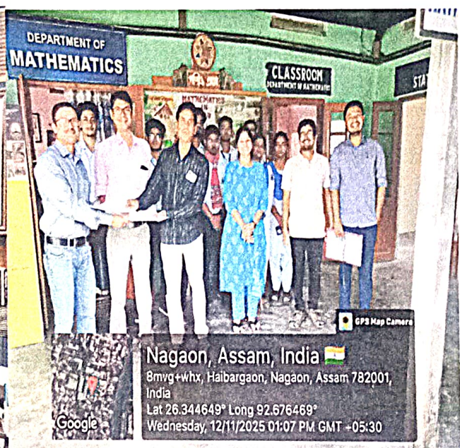
Nagaon, Assam, India 8mvg+whx, Haibargaon, Nagaon, Assam 782001, India Lat 26.344649° Long 92.676469° Wednesday, 12/11/2025 01:07 PM GMT +05:30