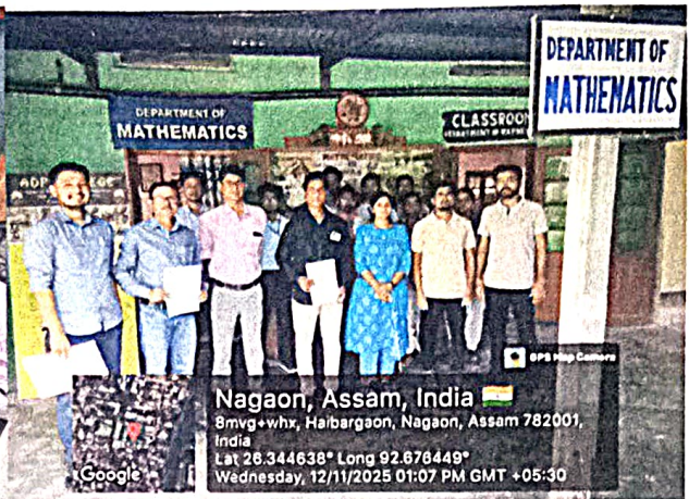
Nagaon, Assam, India 8mvg+whx, Haibargaon, Nagaon, Assam 782001, India Lat 26.344638° Long 92.678449° Wednesday, 12/11/2025 01:07 PM GMT +05:30